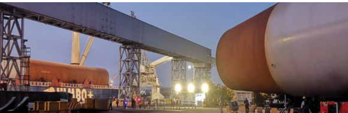
Photo above: Delivery of the transition pieces for the Yunlin offshore wind farm Photo below: Delivery of the monopiles

The offshore construction phase is due to begin in April with the aim of installing all monopiles and transition pieces by the end of the year. Successful implementation of the local content strategy is thus becoming a flagship policy as it will play a major role in future tenders in Taiwan. It is well understood in the Taiwanese wind market that wpd is equipped for this task.