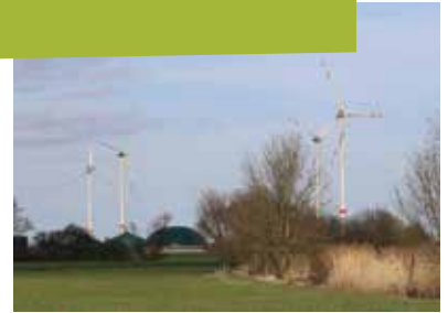
Schlüsselburg wind farm

Construction of the wind farm was not short of challenges: For example, as the local mains was unable to absorb the volume of electricity generated, a horizontal duct had to be drilled through the rocky ground below the nearby river Weser to allow a 4.5 km cable to be laid to the Leese transformer substation. From there, green electricity is now being fed into the grid.