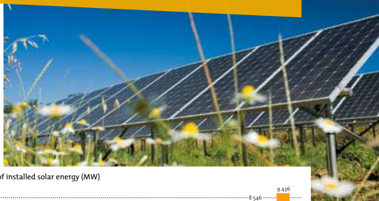
Development of installed solar energy (MW)

In this way, a project pipeline for solar farms has been created in suitable open spaces, ideally close to grid connection points. In France, too, the subject of "floating PV", i.e. the use of expanses of water for major solar projects, is gaining in importance.