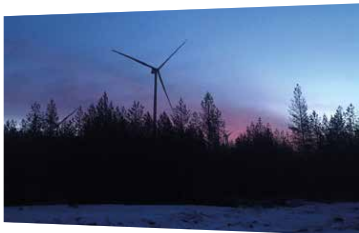
Kuuronkallio wind farm in the municipality of Kannus

The focus thus continues to be on the energy markets in European countries outside Germany where wpd has already acquired extensive expertise in this type of marketing. Our experience with PPAs steadily accumulated since 2006 is reflected particularly in Finland and Sweden where wpd is supplying large companies such as Google, UPM and further well-known enterprises with energy from its own wind farms.