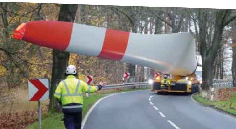
The Bladelifter can even transport rotor blades round tight bends

The ability to find a solution to every challenge turns out to be a valuable asset in the construction phase of a project as René Ittryk, Head of the Construction Department at wpd Infrastruktur GmbH, emphasises: "So far there hasn't been a wind farm that has failed to be built due to the difficulty of the infrastructure problems, and we owe that to the many, competent and creative specialist teams within wpd."